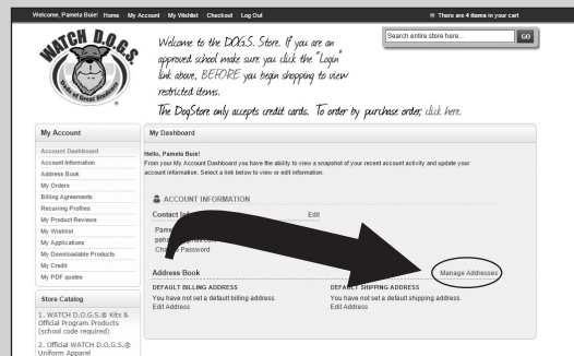
Account set up page

Don't forget to purchase WATCH D.O.G.S.® promotional items and t-shirts! To do so, click "Continue Shopping."