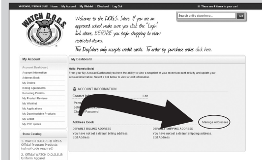
Account set up page

Don't forget to purchase t-shirts for your children! To do so, click "Continue Shopping" and access the "Promotional Apparel" category to purchase other items.